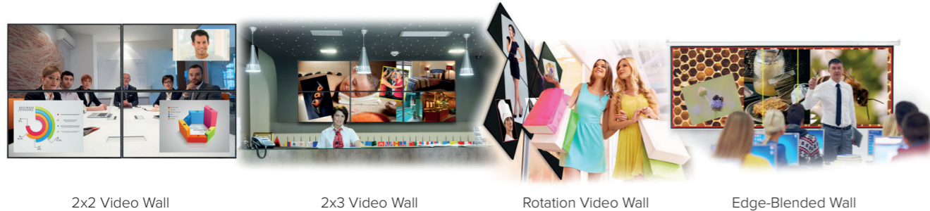
2x2 Video Wall