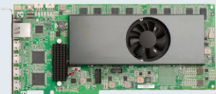
Matrox Maevex 6100 Quad 4K Encoder Card