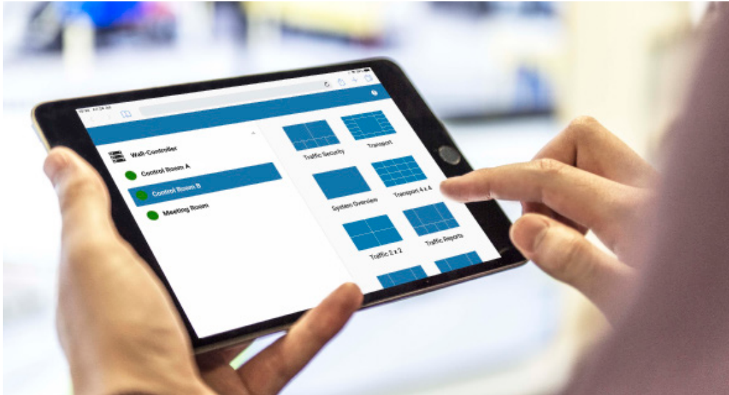
Layouts can be accessed via the web interface